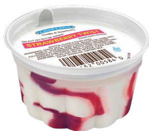
NF/NS STRAWBERRY SWIRL